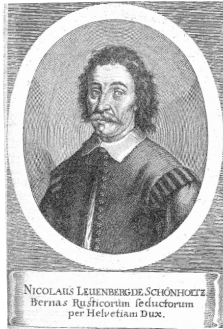
Fig. 1a: Niklaus Leuenberger, the allegedly penitent revolutionist. Portrayal after being captured in 1653.

No portrayal exists showing Niklaus Leuenberger as a triumphant leader after he had signed the Murifeld Peace Treaty and declared the 37 articles of the treaty to his