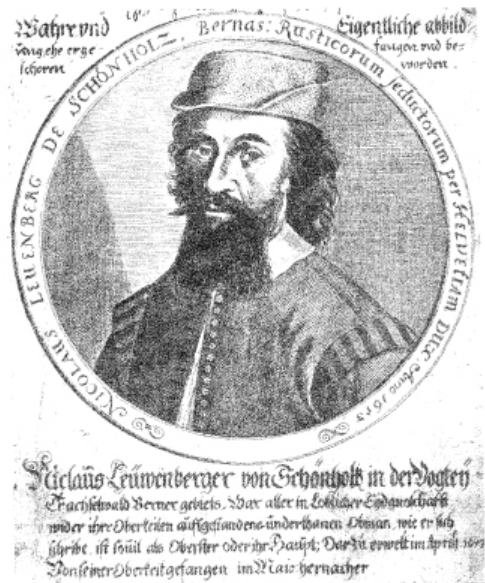
Fig. 1b (right): Contemporary Portrayal of Niklaus Leuenberger before he was captured.